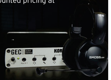
Group Learning Labs